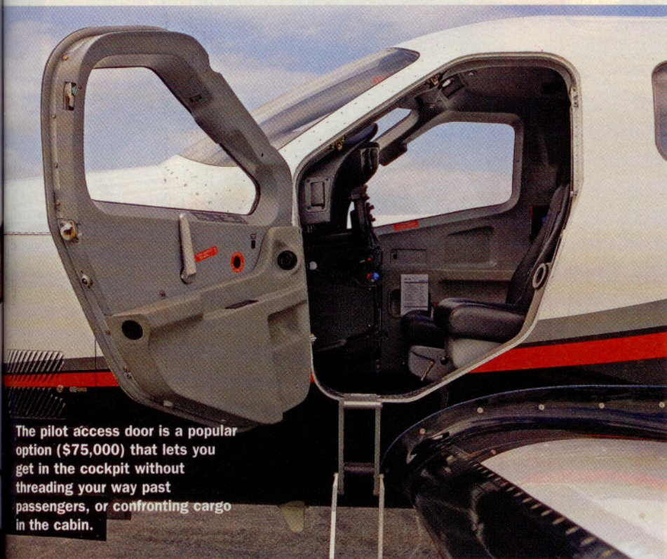
The pilot access door is a popular option ($75,000) that lets you get in the cockpit without threading your way past passengers, or confronting cargo in the cabin.

Socata argues that the TBM 850 thrives in the mid-20s, an altitude range that allows the airplane to fly at its top speeds, unencumbered by airliners.