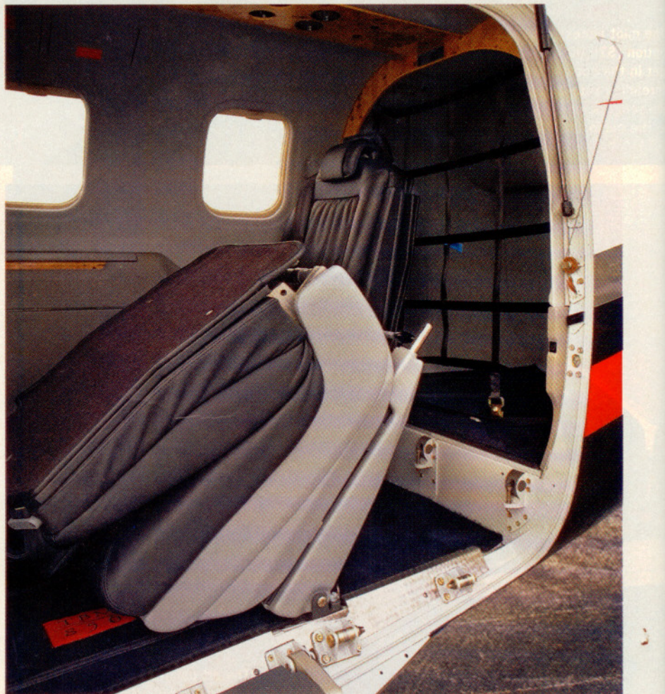
The club-style passenger area (top) has been changed slightly to give more shoulder room, and a single storage cabinet is now standard. A second cabinet with a CD player is a $5,600 option. Aft seats (above) fold forward for loading the aft baggage compartment.