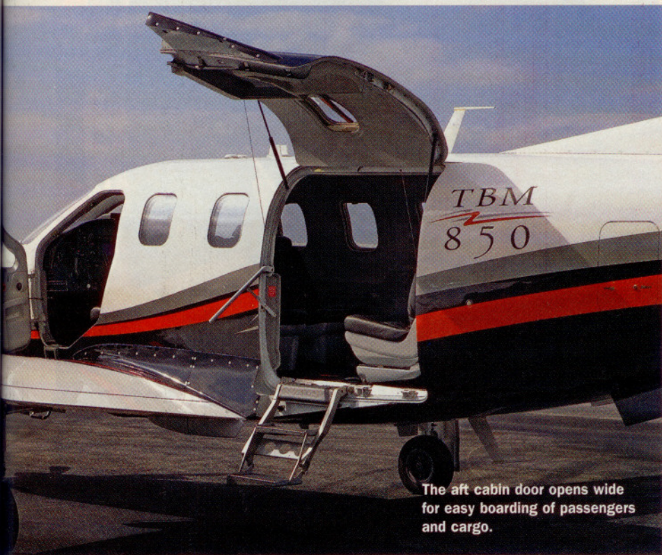
The aft cabin door opens wide for easy boarding of passengers and cargo.

training for the VLJ pilot, and the TBM 850 looks even better.